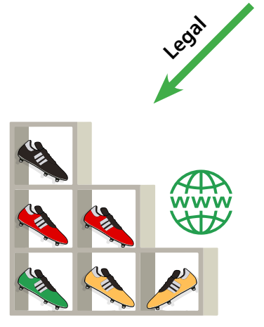
Crikey.com Official Website

Crikey.com Manufacturers of kangaroo soccer shoes