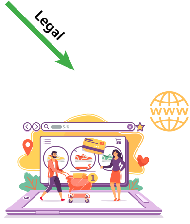
BigCleat.com Online Retailer