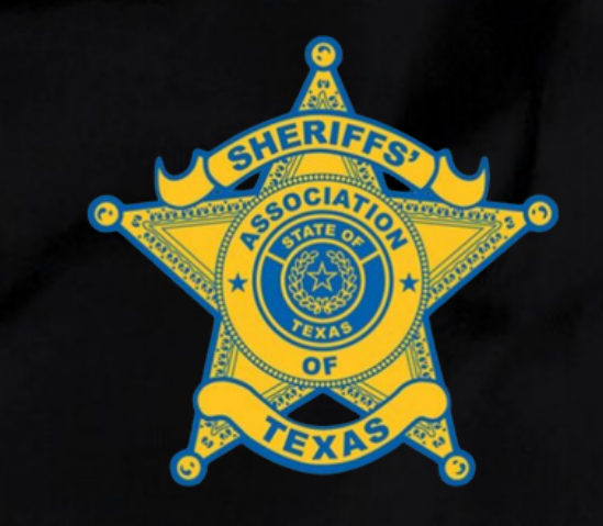
Sheriffs' Association of Texas