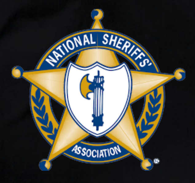
National Sheriffs' Association