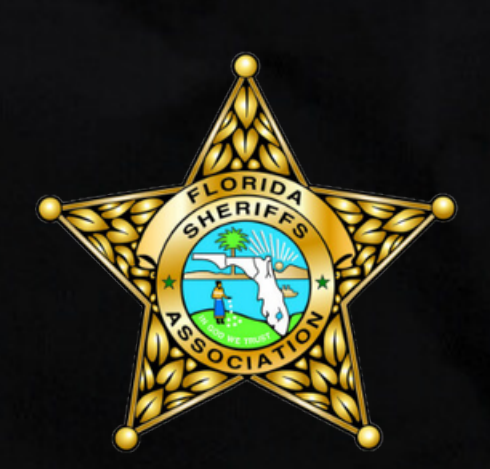
Florida Sheriffs' Association