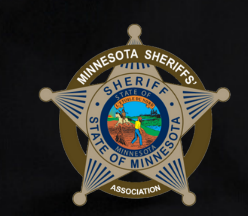
Minnesota Sheriffs' Association