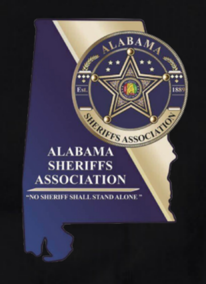
Alabama Sheriffs' Association