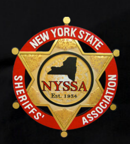
New York State Sheriffs' Association