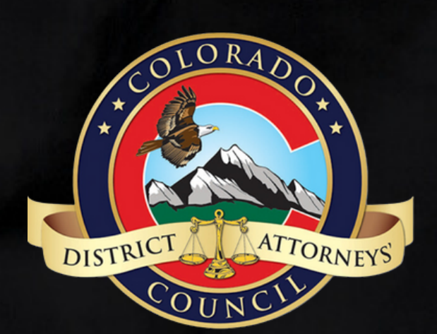
Colorado District Attorneys' Council