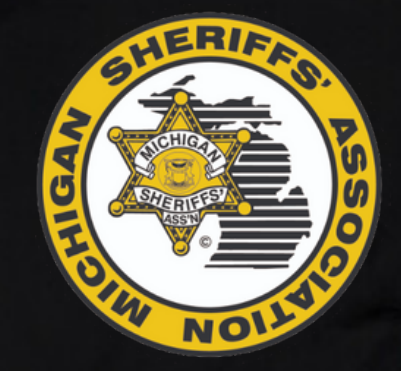
Michigan Sheriffs' Association