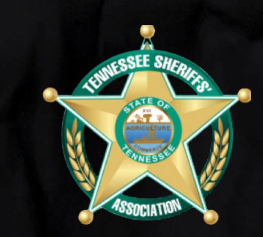
Tennessee Sheriffs' Association