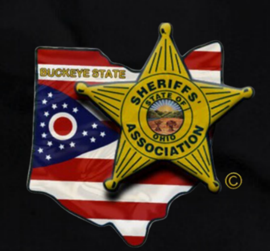
Buckeye State Sheriffs' Association