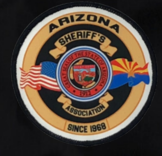
Arizona Sheriffs' Association