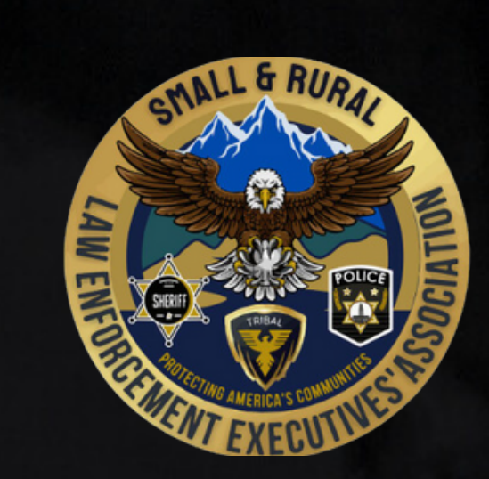
Small and Rural Law Enforcement Executives Association