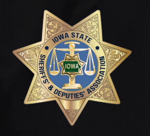
Iowa Sheriffs' Association and Deputies' Association