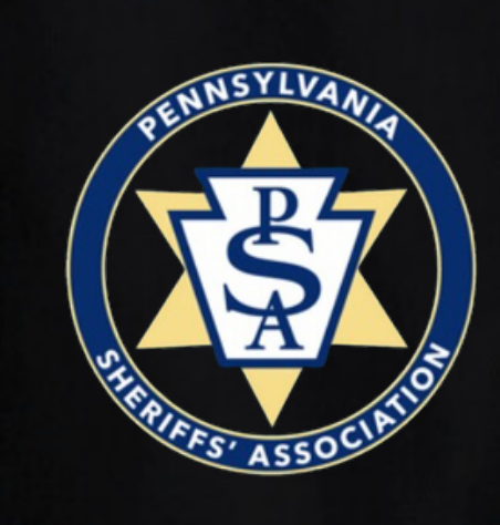
Pennsylvania Sheriffs' Association