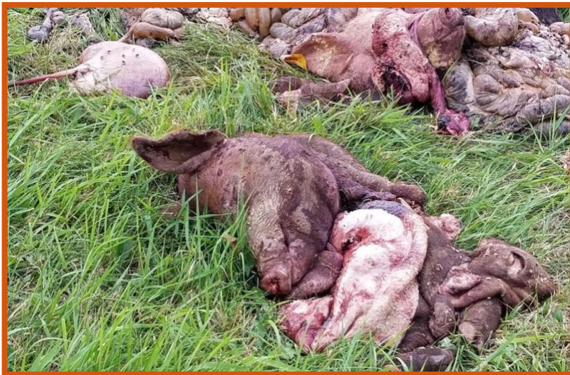
Bait pile left on side of road in Addison County by coyote hunters.

The Council to Advance Hunting and the Shooting Sports surveyed attitudes towards different types of hunting. Hunting over bait had significantly less support than hunting with a bow and arrow or gun. More respondents disapproved of hunting over bait than approved of the practice. Allowing this harmful practice erodes the public's acceptance of hunting overall.