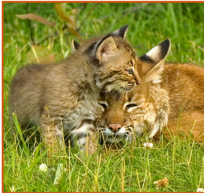
Bobcats are one of the species currently allowed to be hunted over bait.

According to the American Veterinary Medical Association, 28% of Vermont households own a dog. Public lands are for shared recreation, yet Vermont allows baiting furbearers on various public lands where dogs are not required to be leashed.