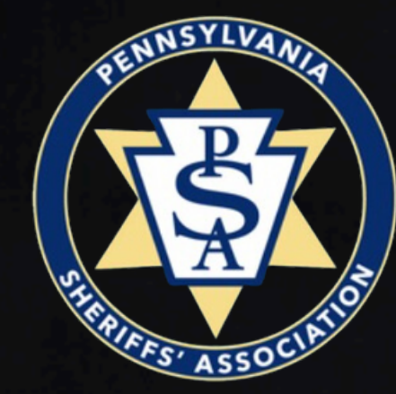
Pennsylvania Sheriffs' Association