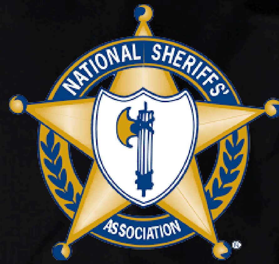
National Sheriffs' Association