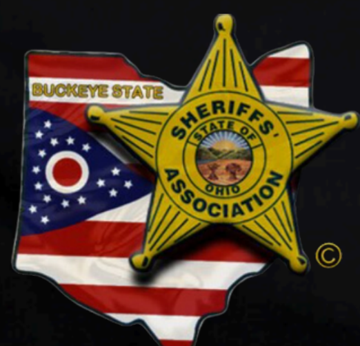
Buckeye State Sheriffs' Association