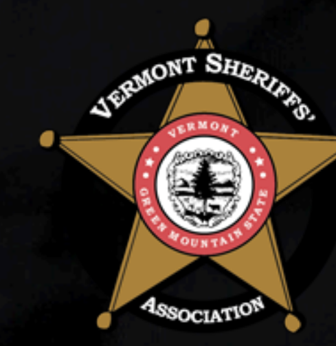
Vermont Sheriffs' Association