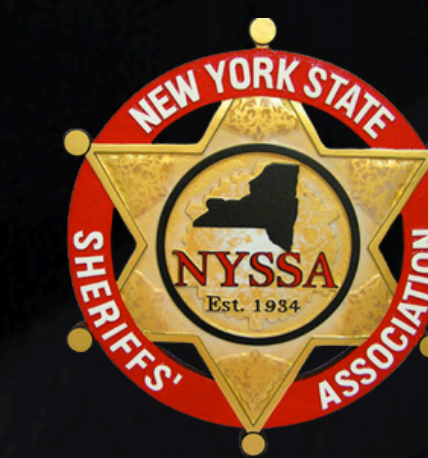
New York State Sheriffs' Association