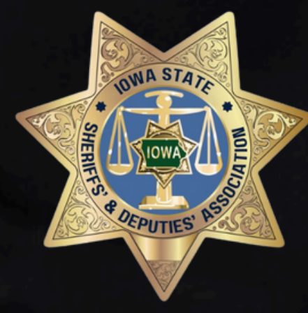
Iowa Sheriffs' Association and Deputies' Association