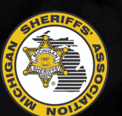
Michigan Sheriffs' Association