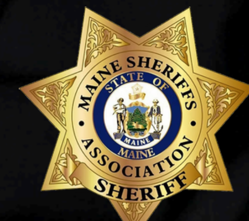
Maine Sheriffs' Association