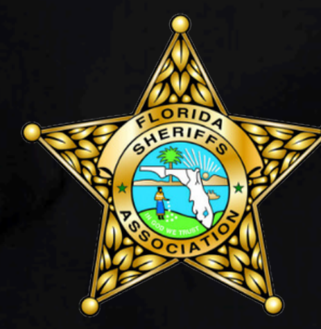
Florida Sheriffs' Association