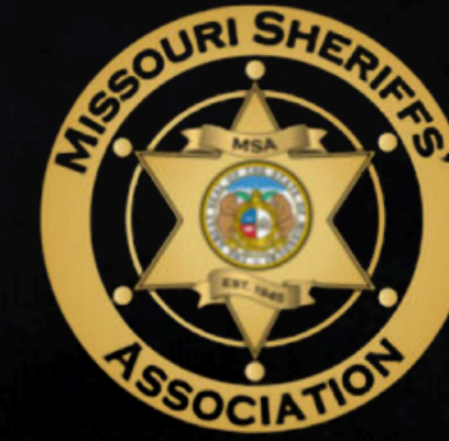
Missouri Sheriffs' Association