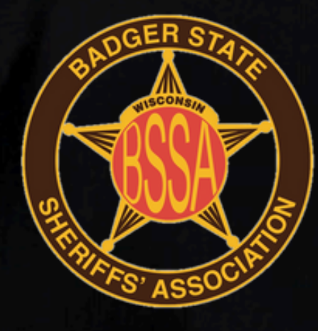
Wisconsin Badger State Sheriffs' Association