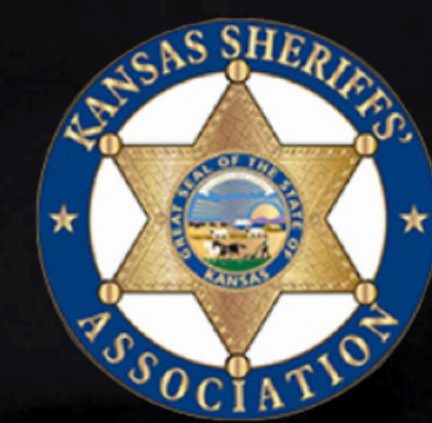
Kansas Sheriffs' Association