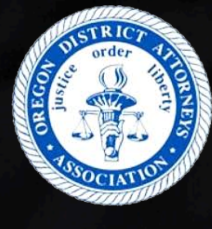
Oregon District Attorneys Association