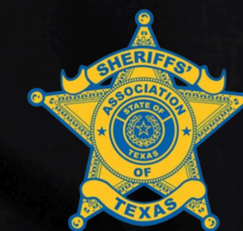
Sheriffs' Association of Texas