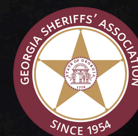
Georgia Sheriffs' Association