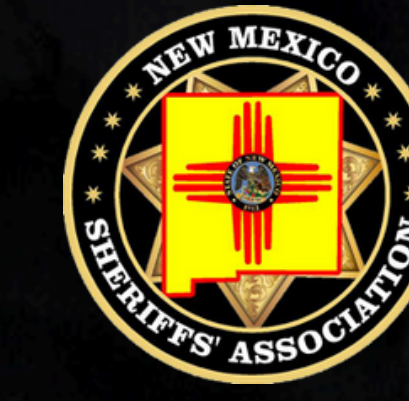
New Mexico Sheriffs' Association