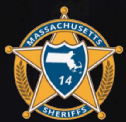
Massachusetts Sheriffs' Association