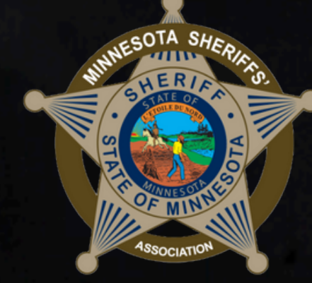
Minnesota Sheriffs' Association