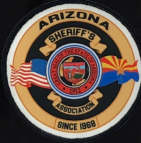
Arizona Sheriffs' Association