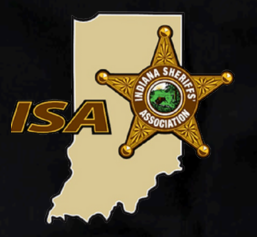
Indiana Sheriffs' Association