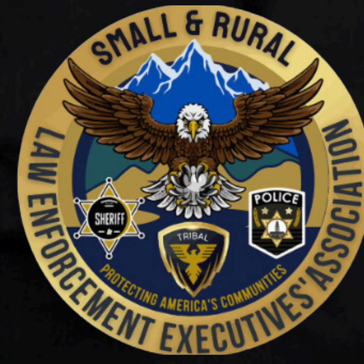
Small and Rural Law Enforcement Executives Association