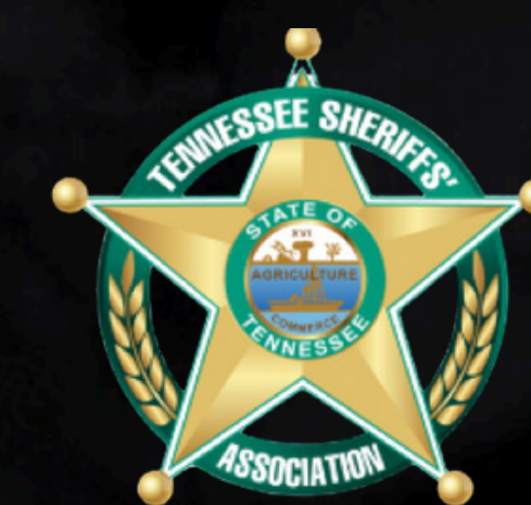
Tennessee Sheriffs' Association