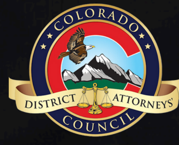
Colorado District Attorneys' Council