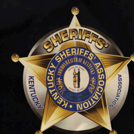
Kentucky Sheriffs' Association