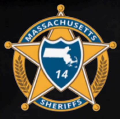
Massachusetts Sheriffs' Association