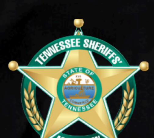
Tennessee Sheriffs' Association