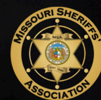
Missouri Sheriffs' Association