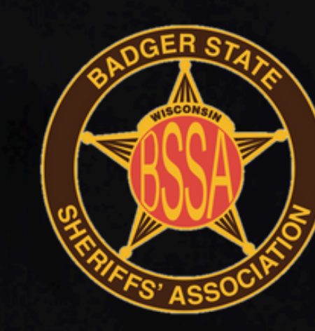
Wisconsin Badger State Sheriffs' Association