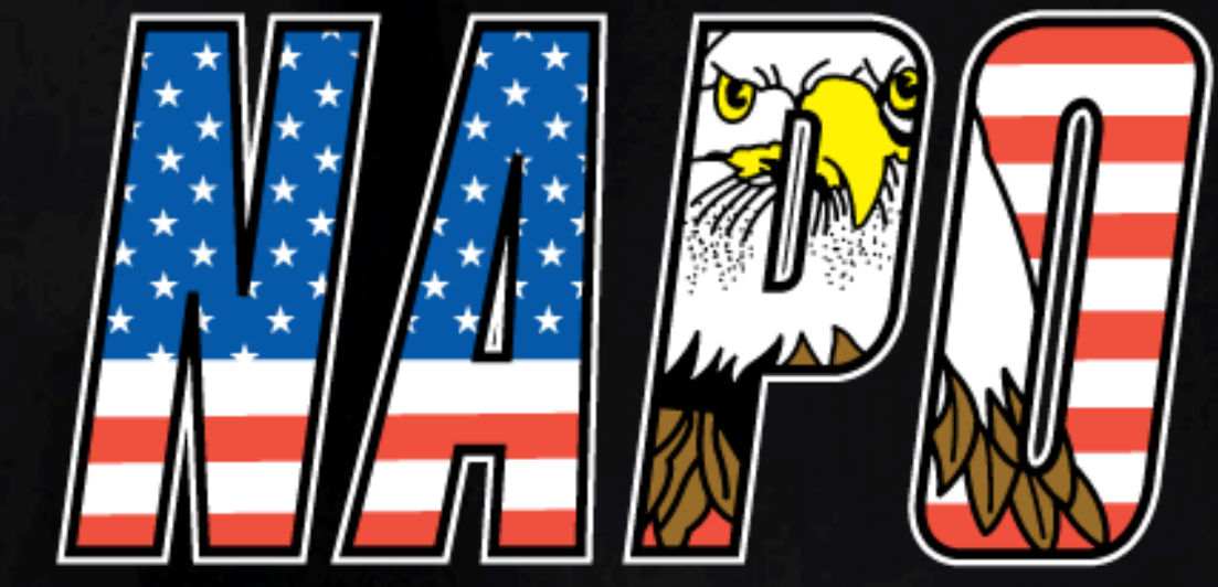
National Association of Police Organizations