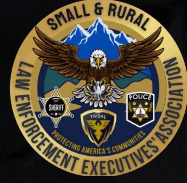
Small and Rural Law Enforcement Executives Association