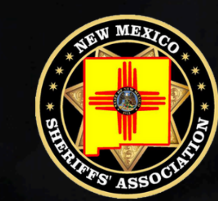
New Mexico Sheriffs' Association