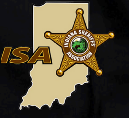
Indiana Sheriffs' Association