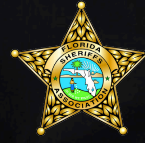
Florida Sheriffs' Association