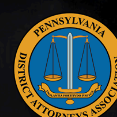
Pennsylvania District Attorneys Association