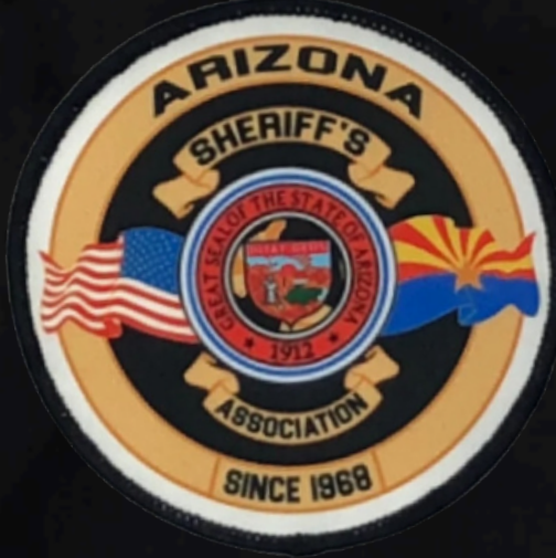
Arizona Sheriffs' Association