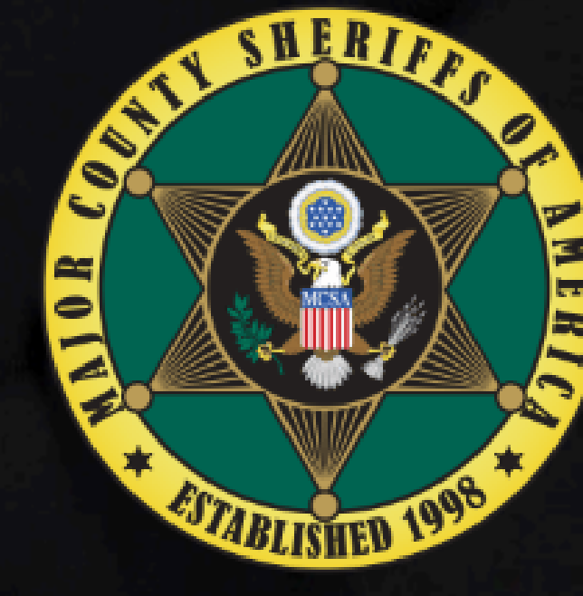
Major County Sheriffs of America