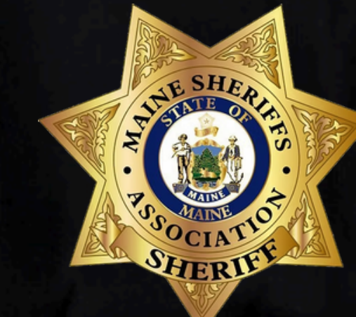
Maine Sheriffs' Association