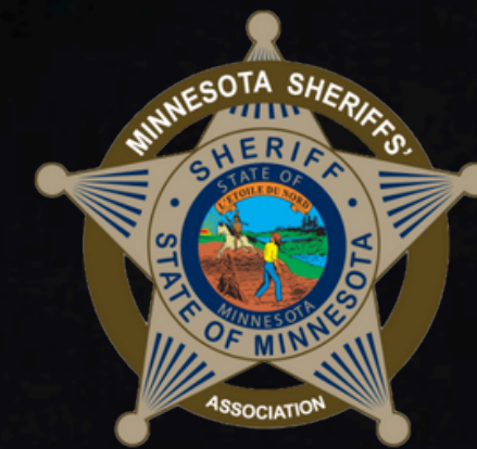
Minnesota Sheriffs' Association