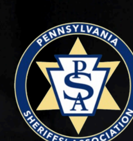
Pennsylvania Sheriffs' Association