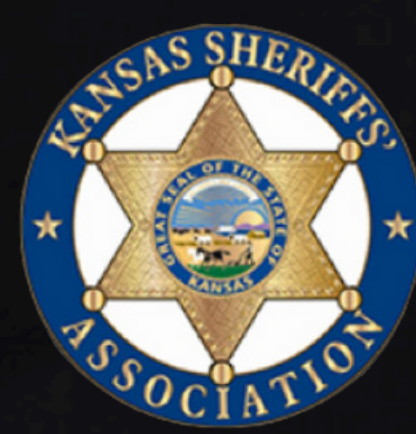
Kansas Sheriffs' Association