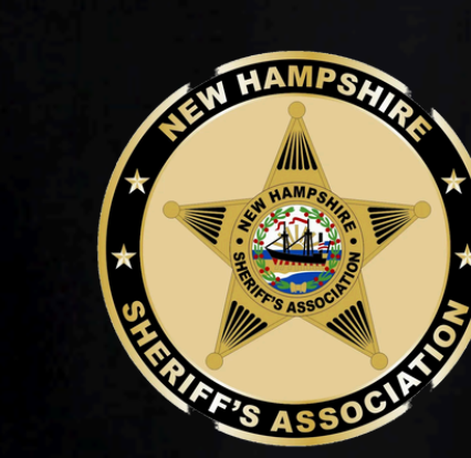
New Hampshire Sheriff's Association