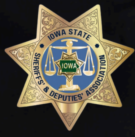
Iowa Sheriffs' Association and Deputies' Association