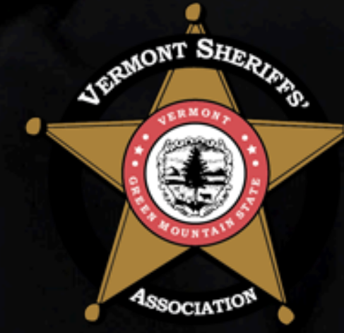
Vermont Sheriffs' Association