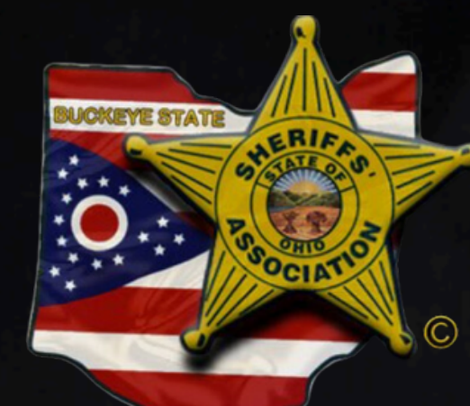
Buckeye State Sheriffs' Association