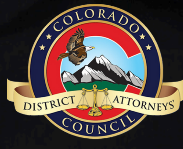
Colorado District Attorneys' Council