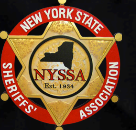
New York State Sheriffs' Association