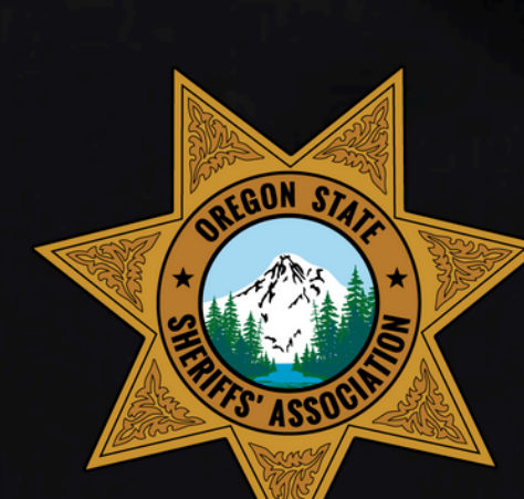
Oregon State Sheriffs' Association