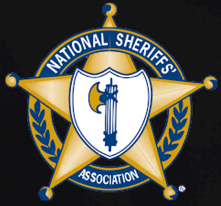
National Sheriffs' Association