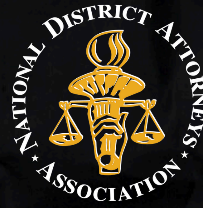
National District Attorneys Association