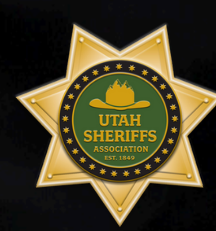
Utah Sheriffs' Association