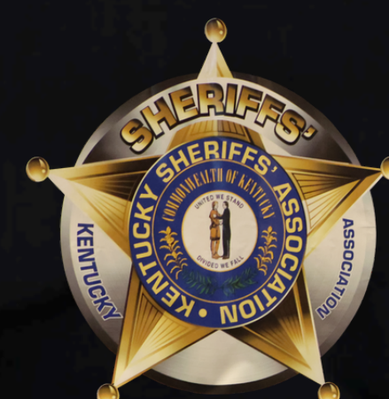
Kentucky Sheriffs' Association