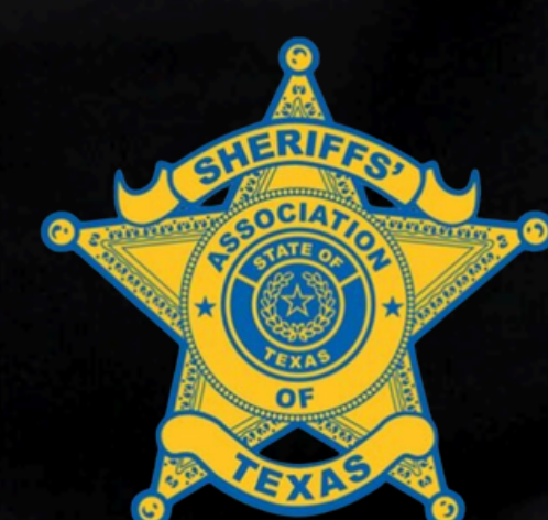
Sheriffs' Association of Texas